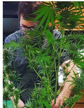
“From the harvest Fall 2018”