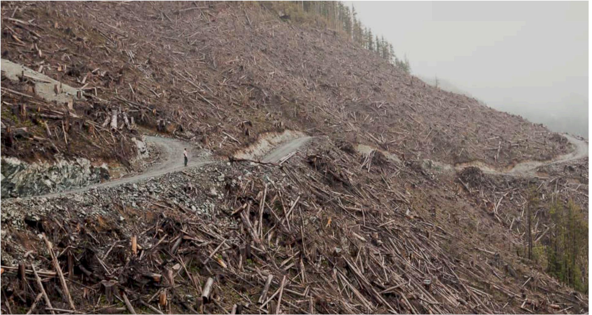
"Forest clearcut near Port Renfrew, British Columbia", by TJ Watt, 2018,

https://thenarwhal.ca/25-years-after-clearcut-and-how-decades-the-war-in-the-woods-never-ended-and-its-heating-back-up/ Reprinted with permission.