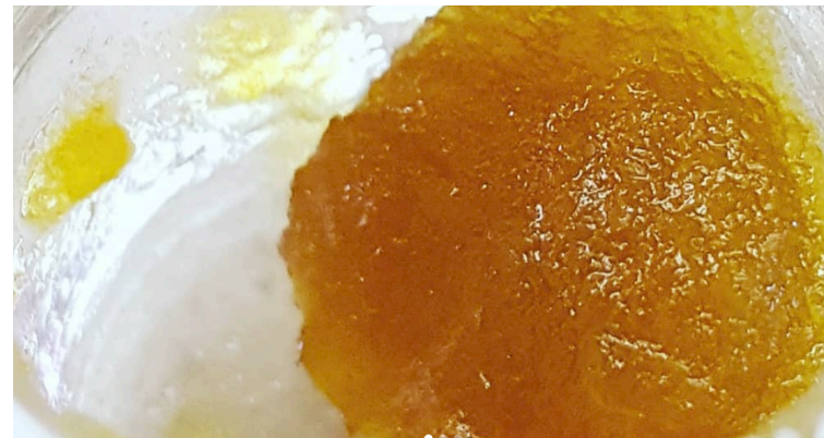
“Amnesia Haze cola”