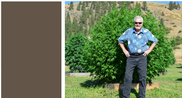
A rural B.C. farmer at his outdoor medically licensed cannabis garden

“How can the Kootenay region effectively transition to the new rural cannabis economy?”